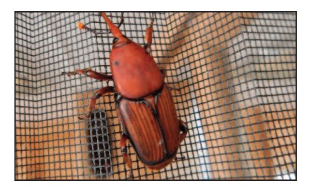
Red Palm Weevil

Anyone familiar with weevils will know that they can be 1.5mm up to 10mm long in the UK but this was 40mm long. Photos were taken and I thought nothing more of it until we had two more fly by and a few days later another crash land on an outside table.