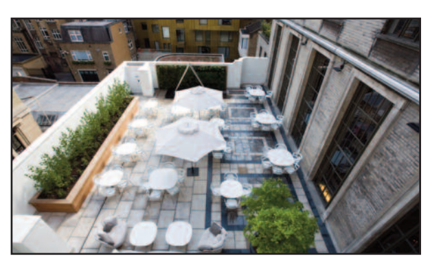
RIBA's lovely drinks terrace

fter many years of being held at the Park Plaza Riverbank Hotel on London's Albert Embankment in March – PICT has decided it's time to revitalise its Annual Lunch with an exciting move to an inspirational new venue in Central London and a new date.