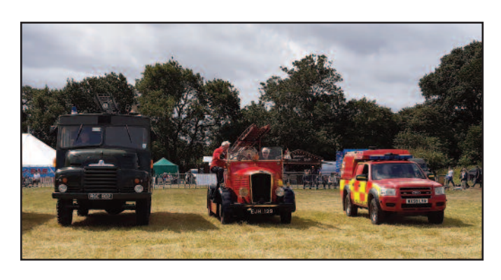
The Dennis Ace fire engine out and about

Also with the summer months, come the various county shows and fayres, and recently I went to a local steam rally (Potten End Steam Rally) and the Frogmore Paper Mill fire engine was on display, not only promoting The Paper Trail but delighting all the visitors — as of all the fire engine styles over the years, I think it is definitely the most akin to the Trumpton fire engine and not only attracts a lot of attention but it makes everyone smile!