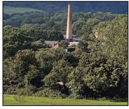
St Cuthberts Mill from the campsite