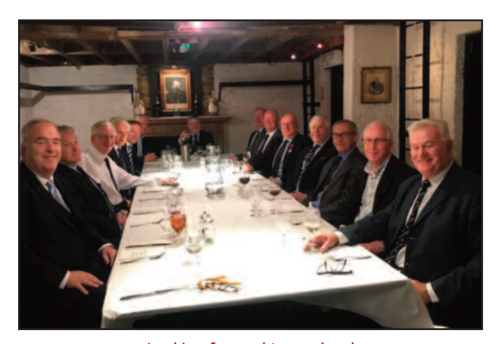
Looking forward to our lunch

hough a few less attendees this time, 15 in all, a splendid lunch was laid out for us at our traditional 'home', the Boot & Flogger wine bar in Southwark. The lunch held on Thursday 20th April, is one of the two lunches organised by The London Pride Society, always on a Thursday, to coincide as closely as possible with St George's Day and Armistice Day.