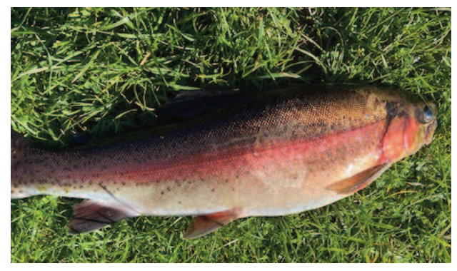
A lovely Brown Trout